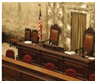
Western Mineral and Environmental Resources Science Center: Providing comprehensive earth science for complex societal issues: USGS Circular 1363